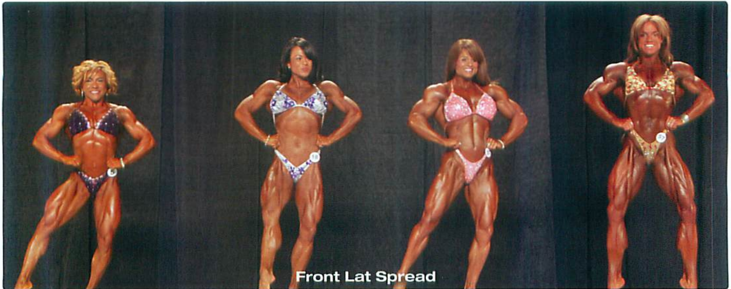
Front Lat Spread