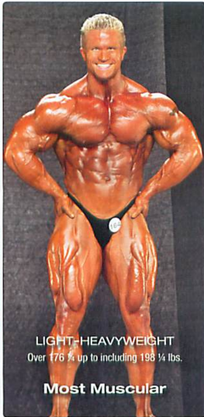
LIGHT-HEAVYWEIGHT Over 176 ¼ up to including 198 ¼ lbs.