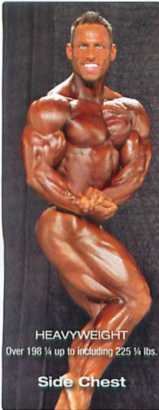
HEAVYWEIGHT Over 198 ¼ up to including 225 ¼ lbs.