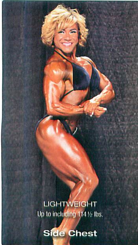
LIGHTWEIGHT Up to including 114½ lbs.