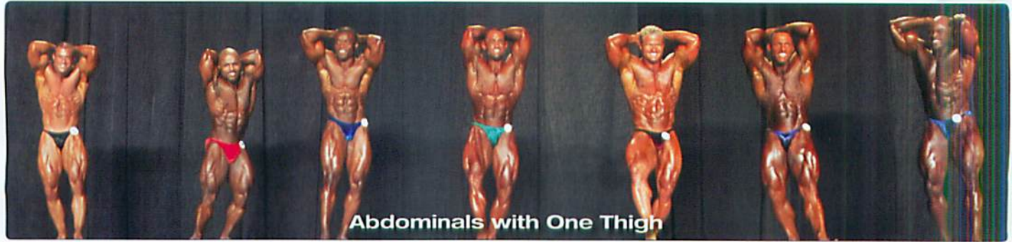
Abdominals with One Thigh