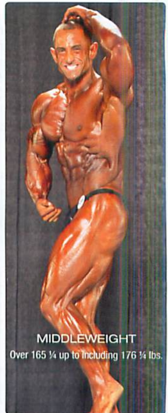
MIDDLEWEIGHT Over 165 ¼ up to including 176 ¼ lbs.