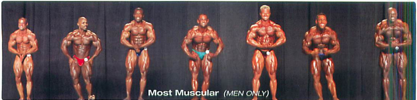
Most Muscular (MEN ONLY)