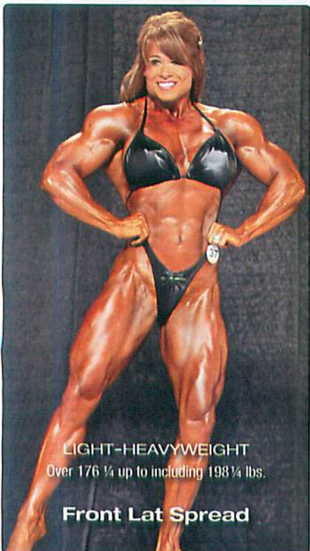
LIGHT-HEAVYWEIGHT Over 176¼ up to including 198¼ lbs.