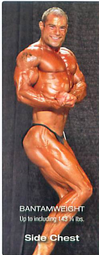
BANTAMWEIGHT Up to including 143 ¼ lbs.