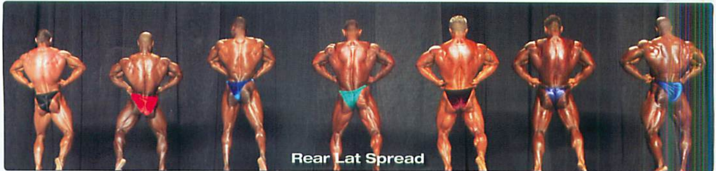
Rear Lat Spread