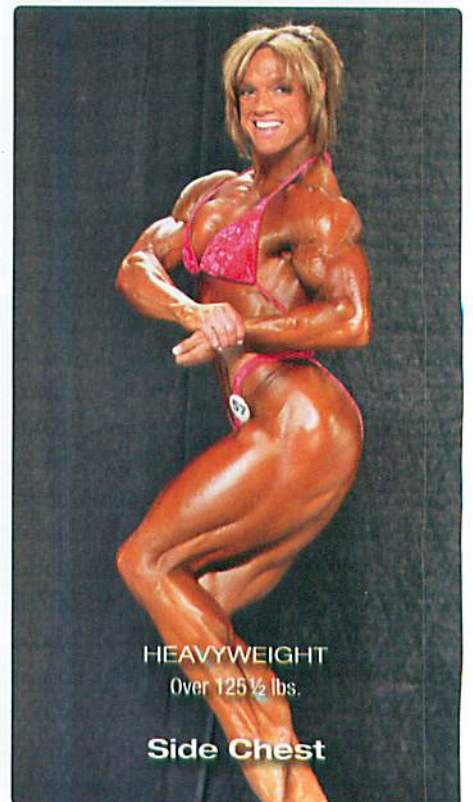
HEAVYWEIGHT Over 125½ lbs.