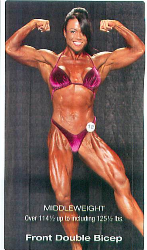
MIDDLEWEIGHT Over 114½ up to including 125½ lbs.